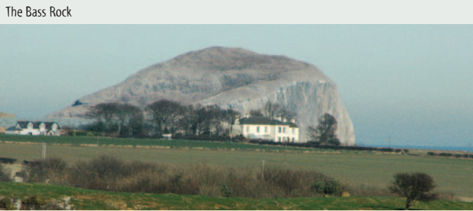
The Bass Rock

Return by the same route or, for a circular walk, carry on along the road a short distance, turn right to go under the bridge to Overhailes, walk through the farm and down the hill to the River Tyne. Turn left and walk back to East Linton along the river bank or cross the footbridge and turn left to return by road. Arriving at Braeheads, turn left, cross over the A199, go down Lauder Place and then left over the river and back up Bridge Street to where you started (add another hour for the circular walk).