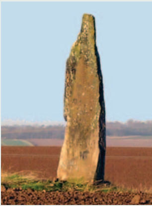
The Long Stane

This vigorous walk will reward you with excellent views from the top of Pencaig Brae. Walk down the High Street away from the fountain and the Square. Continue along Brown's Place then turn left up Langside. Go straight on at the top, along the edge of the playing field and then through the tunnel underneath the railway. Follow the path up the hill, crossing various stiles. In the middle of the last field before the top of Pencaig Brae, the path bears off to the left. You will arrive at the main road; use the pavement for a few yards until you reach the lay-by. You can now look out over the Tyne Valley and the Lammermuir Hills then climb up through the trees behind the lay-by to a fine viewpoint at the top.