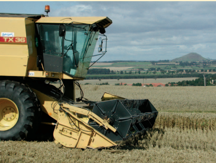
Harvest time in fields around East Linton with Berwick Law in the background