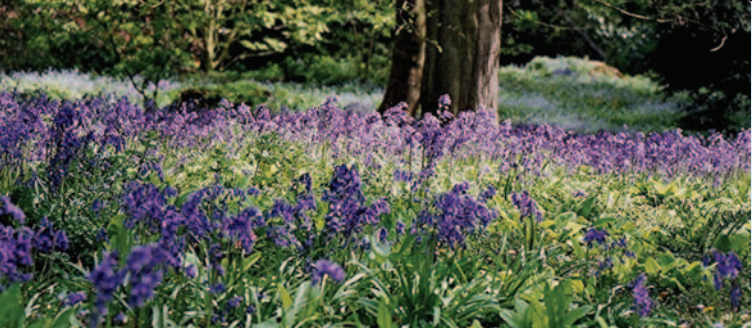
Woodlands around East Linton

This walk journeys along the River Tyne, passing many sites of local and historical interest. Walk north along the High Street and turn right into Preston Road. Pass Preston Kirk on your left and continue until you reach Preston Mill on your right. Go through the Mill grounds and cross the small bridge by the mill wheel. Walk through the field and cross the River Tyne by the white bridge, taking a sharp left following the signs for 'John Muir Way'. Continue along the riverbank. Cross the large metal bridge, turn right and walk along the edge of a field with the River Tyne on your right until you reach a tarmac road. Turn right and you will shortly cross the ford at Knowes Mill by the wooden bridge. Take a sharp left, and take the red whindust path along the banks of the Tyne until you reach the A198 North Berwick Road. Now, either return by the same route to East Linton or climb the steps, taking great care when emerging onto the road as it is busy and fast with blind summits. Turn left and walk down into Tynninghame Village. Here you will find Tynninghame Country Store serving lunches, teas, coffees and cakes. Return to East Linton along the side of the road. There is no path but this road is generally not too busy.