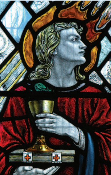
A window from Whitekirk Kirk

Travelling from the A198 by car, turn into Whitekirk village in front of St Mary's Church. Go through the village and park in the small lay-by on the right hand side. This is a peaceful walk across open countryside. At present the path requires you to retrace your steps, a round route is not possible unless you return along the side of the busy A198.