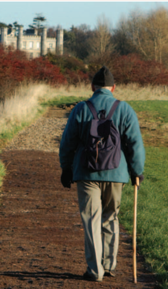
Walking towards Newbyth House

A long route with varied terrain suitable for walkers, bikes and horses. Walk north through the village away from the fountain and Square. Carry on up Drylawhill, cross the road and take the signposted track on the right hand side. Follow the path along the field margin, swinging right along the burn you will cross 2 bridges. Once you have passed through the woods you will be heading to Kamehill. You will pass a cottage on the left hand side at the end of the path. Turn left and then immediately right. Take the track up the hill towards Stonelaws Farm. At the end of the track turn right on to the road. Follow this road until you come to a signpost for East Linton, turn right down the hill and continue along the road past Binning Woods. You will pass the back entrance to Smeaton Nurseries before eventually coming to a T junction. Turn right and follow the road past Preston Mains farm on your right and Preston Mill on your left. At the next T junction you will find yourself in East Linton. Turn left to return to the Tourist Information Point.