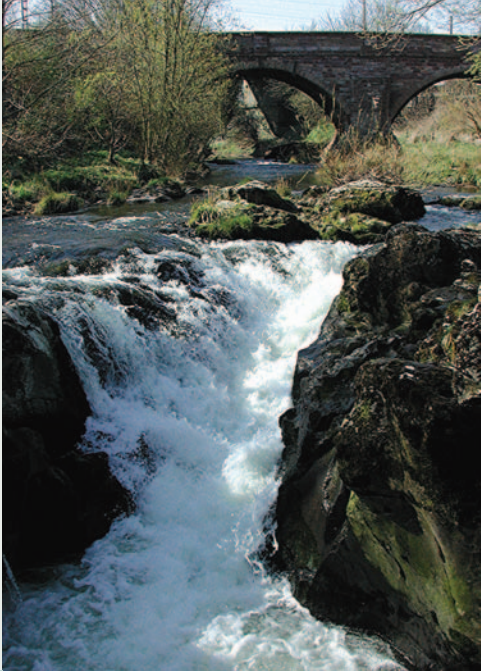
The Linn and Mediaeval road bridge

Follow the path until it comes out of a gate on to Mill Wynd then turn either right or left back up to The Square.