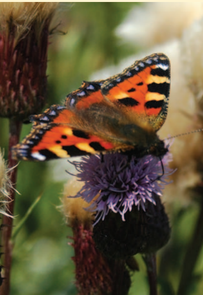
Small tortoiseshell butterfly

The rapid changes that took place during the Agricultural Revolution in the East Linton area in the 18th Century can be traced because of the number of significant 'improvers' who lived in this area.