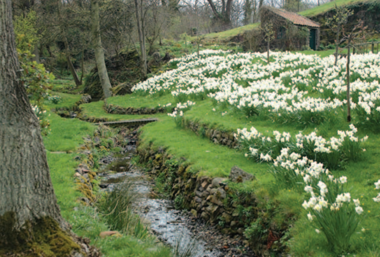
Springtime around Hailes

To extend your walk follow the track next to Hailes Cottage. This leads to Traprain Law, the site of a large Iron Age fort. At the top of Traprain you will experience splendid views across the county.