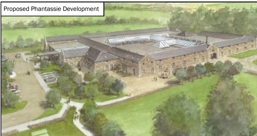
Proposed Phantassie Development

This planning proposal will be discussed on 4 th December at the Community Council meeting if you would like to attend. We are keen to hear your views so do contact any community councillor.