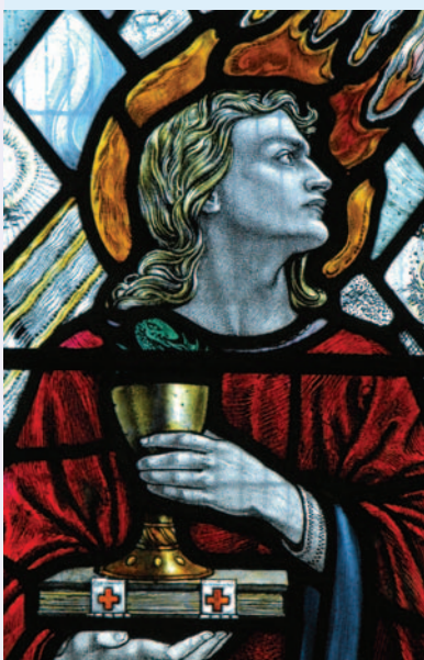
A window from Whitekirk Kirk

Travelling from the A198 by car, turn into Whitekirk village in front of St Mary's Church. Go through the village and park in the small lay-by on the right hand side. This is a peaceful walk across open countryside. At present the path requires you to retrace your steps, a round route is not possible unless you return along the side of the busy A198.