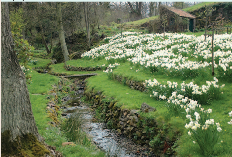
Springtime around Hailes

To extend your walk follow the track next to Hailes Cottage. This leads to Traprain Law, the site of a large Iron Age fort. At the top of Traprain you will experience splendid views across the county.