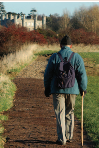
Walking towards Newbyth House

A long route with varied terrain suitable for walkers, bikes and horses. Walk north through the village away from the fountain and Square. Carry on up Drylawhill, cross the road and take the signposted track on the right hand side. Follow the path along the field margin, swinging right along the burn you will cross 2 bridges. Once you have passed through the woods you will be heading to Kamehill. You will pass a cottage on the left hand side at the end of the path. Turn left and then immediately right. Take the track up the hill towards Stonelaws Farm. At the end of the track turn right on to the road. Follow this road until you come to a signpost for East Linton, turn right down the hill and continue along the road past Binning Woods. You will pass the back entrance to Smeaton Nurseries before eventually coming to a T junction. Turn right and follow the road past Preston Mains farm on your right and Preston Mill on your left. At the next T junction you will find yourself in East Linton. Turn left to return to the Tourist Information Point.