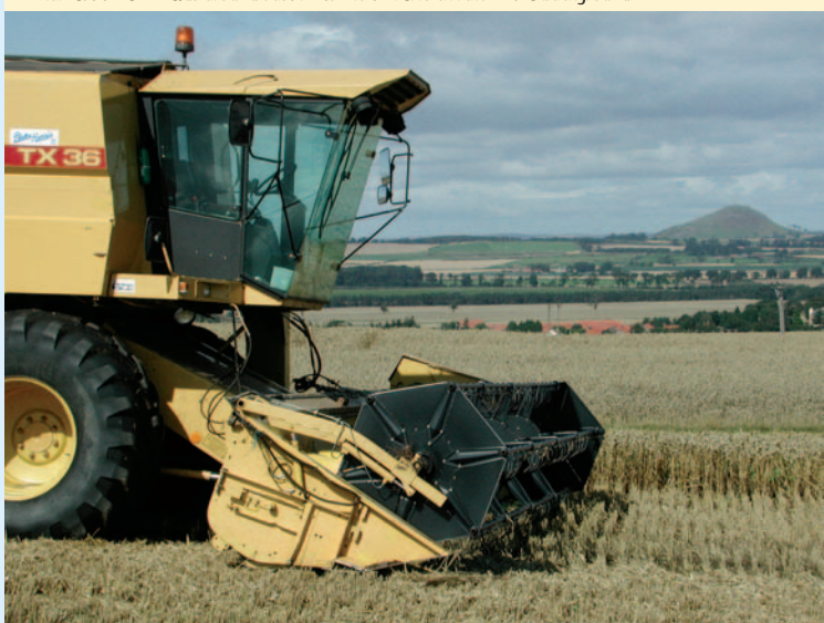
Harvest time in fields around East Linton with Berwick Law in the background