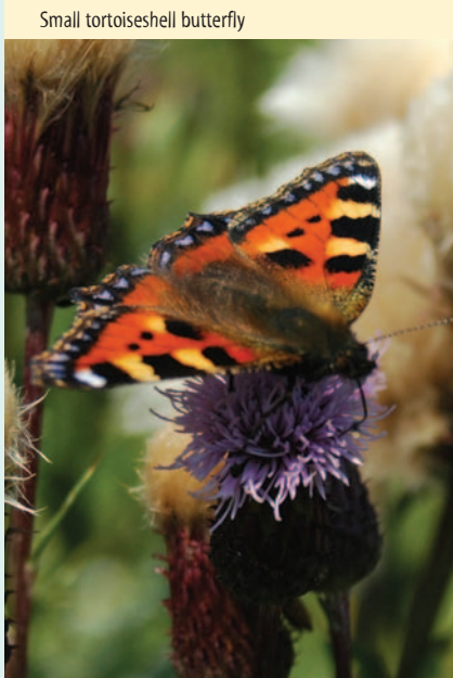
Small tortoiseshell butterfly

It is always worth bearing in mind that much of this wildlife is very shy and easily disturbed. Please make sure that dogs are kept under proper control.