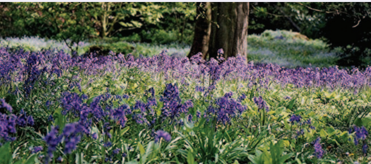
Woodlands around East Linton

This walk journeys along the River Tyne, passing many sites of local and historical interest. Walk north along the High Street and turn right into Preston Road. Pass Preston Kirk on your left and continue until you reach Preston Mill on your right. Go through the Mill grounds and cross the small bridge by the mill wheel. Walk through the field and cross the River Tyne by the white bridge, taking a sharp left following the signs for 'John Muir Way'. Continue along the riverbank. Cross the large metal bridge, turn right and walk along the edge of a field with the River Tyne on your right until you reach a tarmac road. Turn right and you will shortly cross the ford at Knowes Mill by the wooden bridge. Take a sharp left, and take the red windust path along the banks of the Tyne until you reach the A198 North Berwick Road. Now, either return by the same route to East Linton or climb the steps, taking great care when emerging onto the road as it is busy and fast with blind summits. Turn left and walk down into Tynninghame Village. Here you will find Tynninghame Country Store serving lunches, teas, coffees and cakes. Return to East Linton along the side of the road. There is no path but this road is generally not too busy.