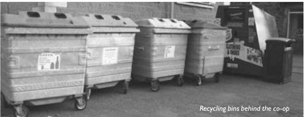
Recycling bins behind the co-op

If you would like items uplifted or more information and opening times call 01875 615891/615797. The warehouse can be visited at Unit 12a, Macmerry Industrial Estate, Macmerry EH33 1RD. Visit www.recyclingfirst.freeuk.com