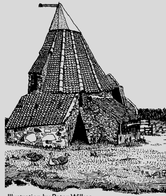
Illustration by Peter Wilkes

See you for Carols round the Fountain East Linton Square 24th December 7pm