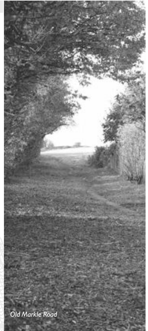
Old Markle Road

The work was carried out by local company Marche Hare. Enquiries: 861815