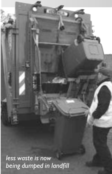
less waste is now being dumped in landfill